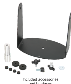
Included accessories and hardware

* Splowt A unit of measure, expressed as dB, that divides a speaker's maximum SPL by it's weight in pounds. Galaxy Audio's NANO SPOT boasts a splowt of 58 dB (highest in the known universe).